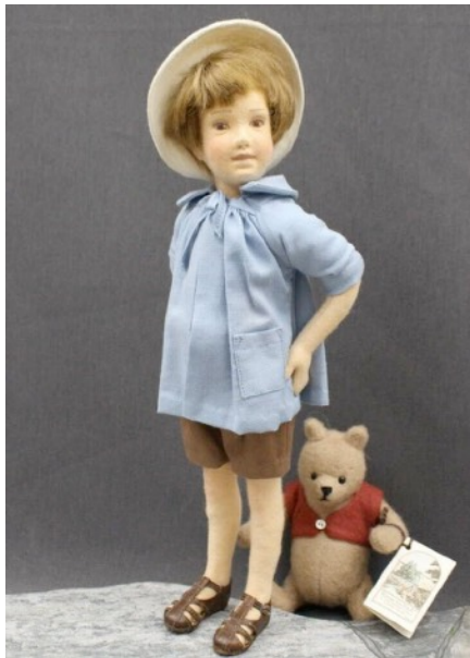
Christopher Robin with Winnie-the-Pooh