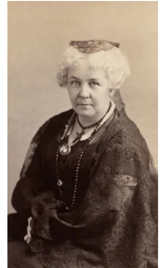
Elizabeth Cady Stanton