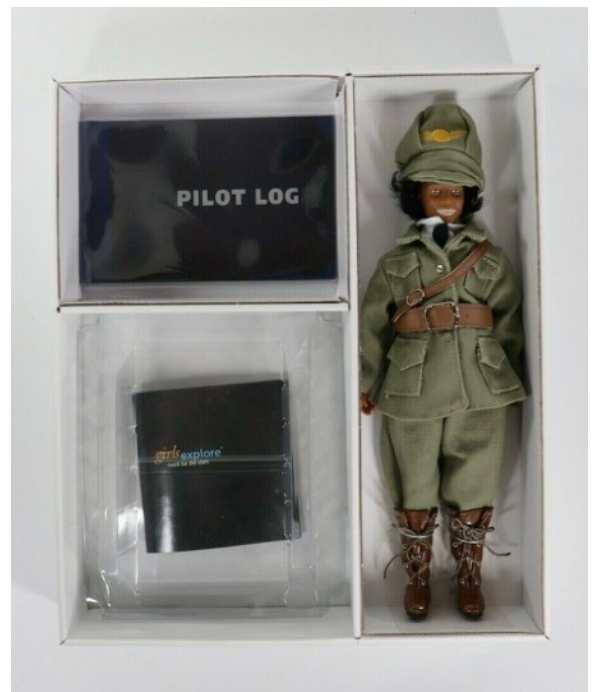
Bessie Coleman First African American Aviator