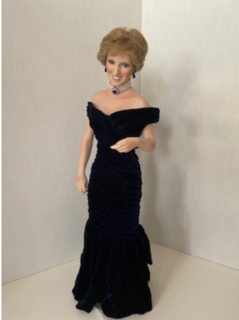
Diana, Princess of Wales