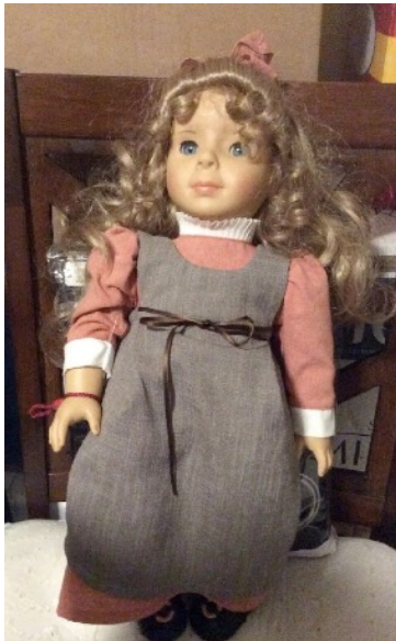
Elizabeth Cady Stanton